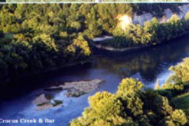
Crocus Creek & Bar